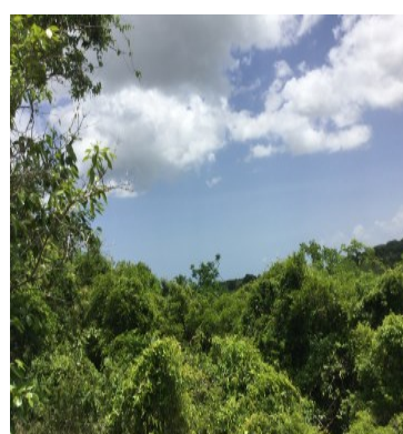
SEE THIS PROPERTY IN MAP