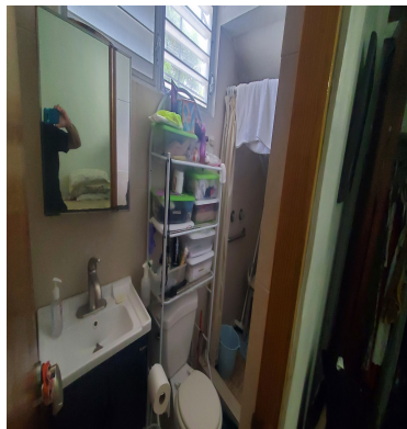
SEE THIS PROPERTY IN MAP